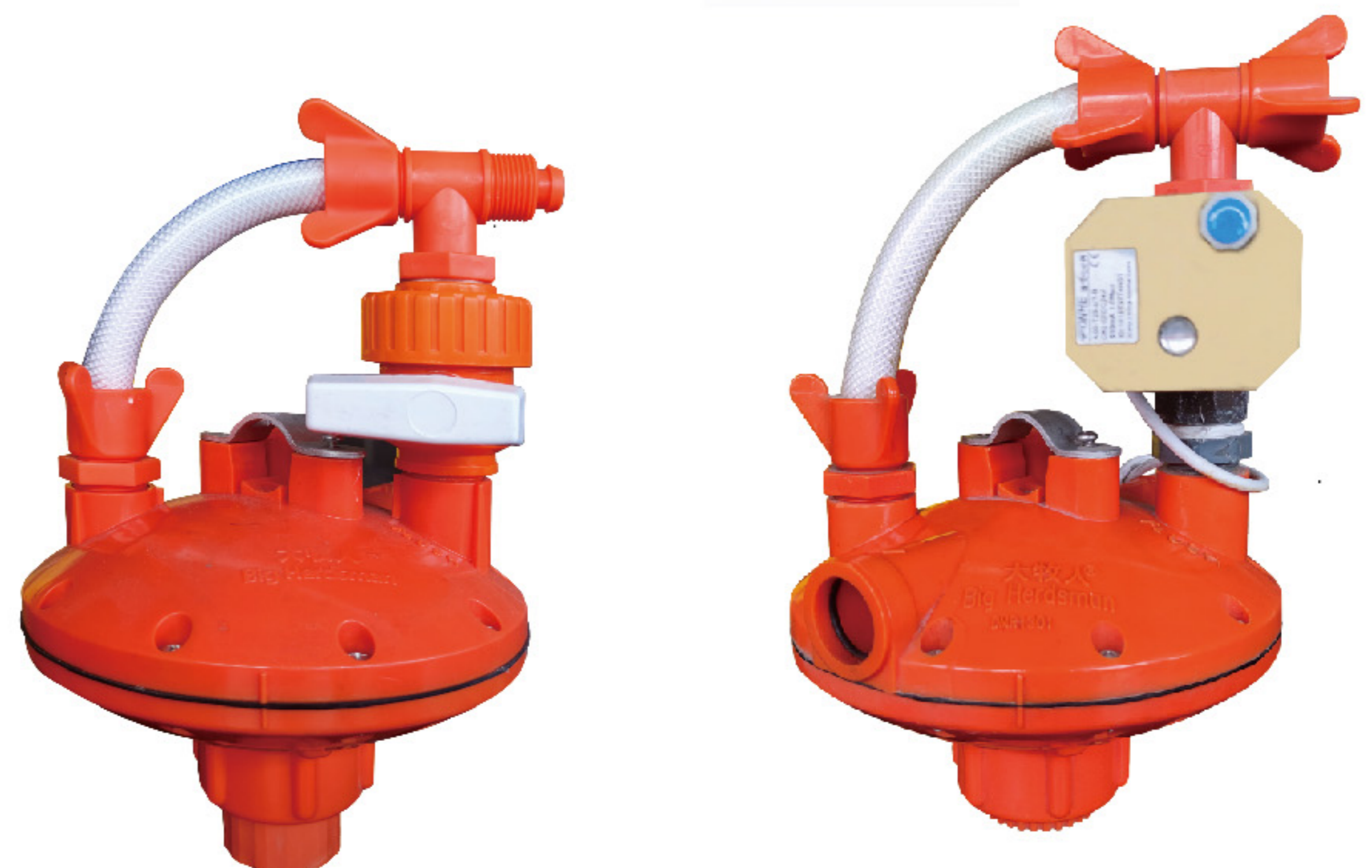
饮水乳头饲养量 Drinking nipple feeding capacity